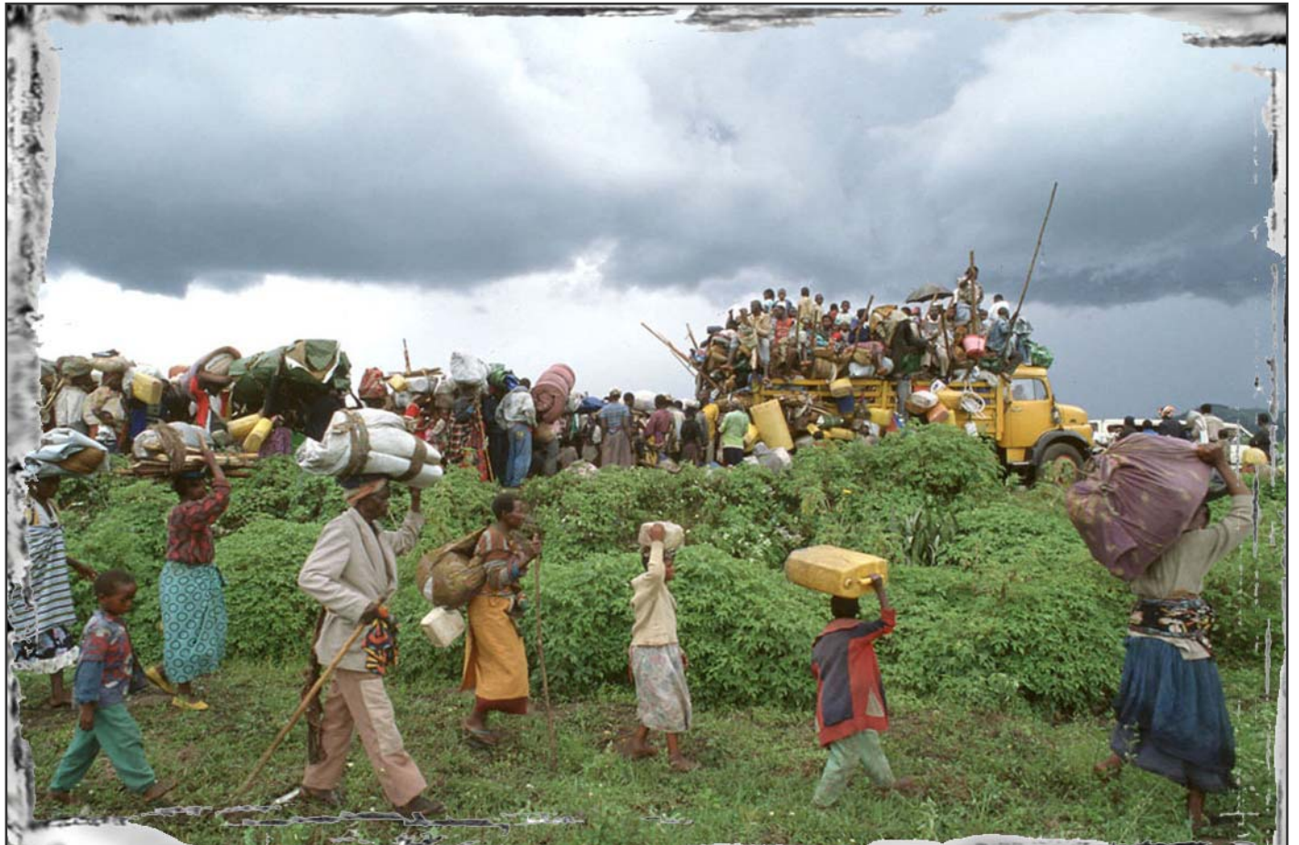
Hutu refugees abandon the camps ahead of fighting in the Congo near Goma and flee back across the Rwanda border.